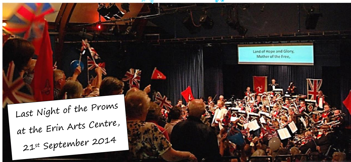
Last Night of the Proms at the Erin Arts Centre, 21 st September 2014