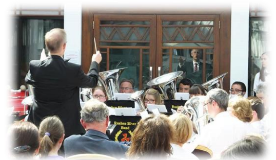
Villa Marina Arcade - July 2015

A few snapshots (in no particular order!) of some of the events the Band have been involved in over a busy, challenging and exciting year: